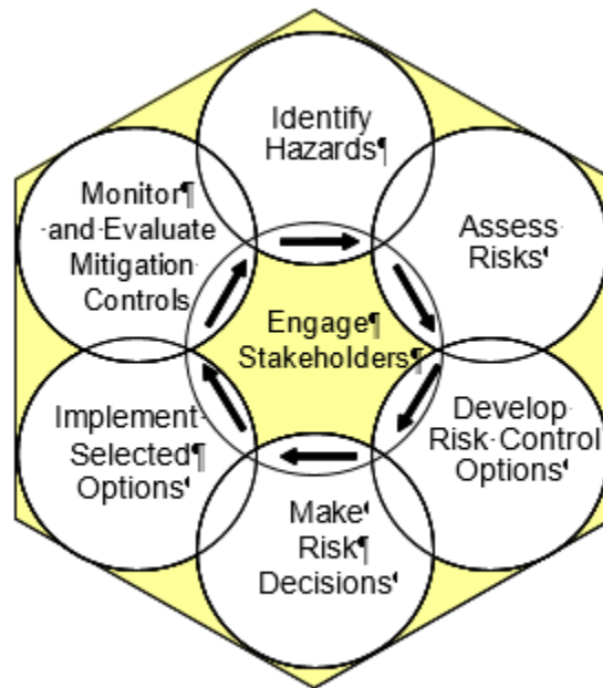
Figure. Explosives Safety Risk Management Model

(2) Evaluate the risk from identified hazards.